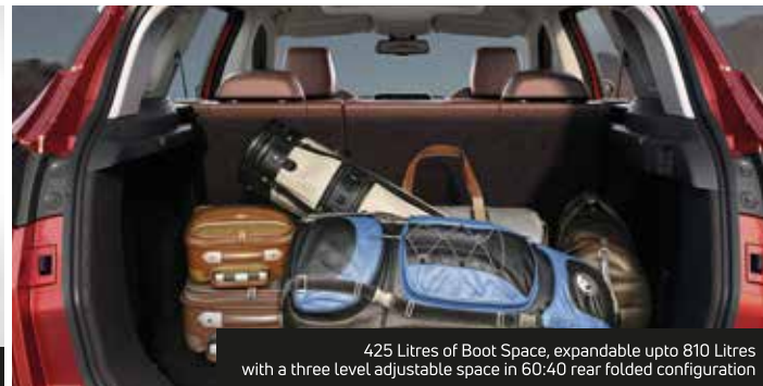
425 Litres of Boot Space, expandable upto 810 Litres with a three level adjustable space in 60:40 rear folded configuration