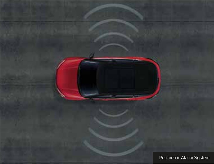
Perimetric Alarm System