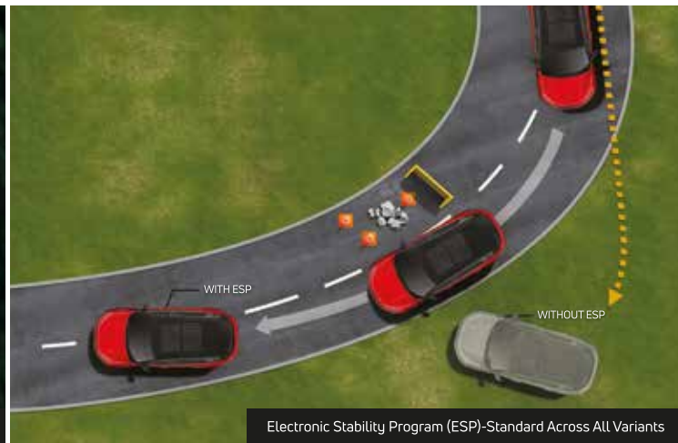
Electronic Stability Program (ESP)-Standard Across All Variants