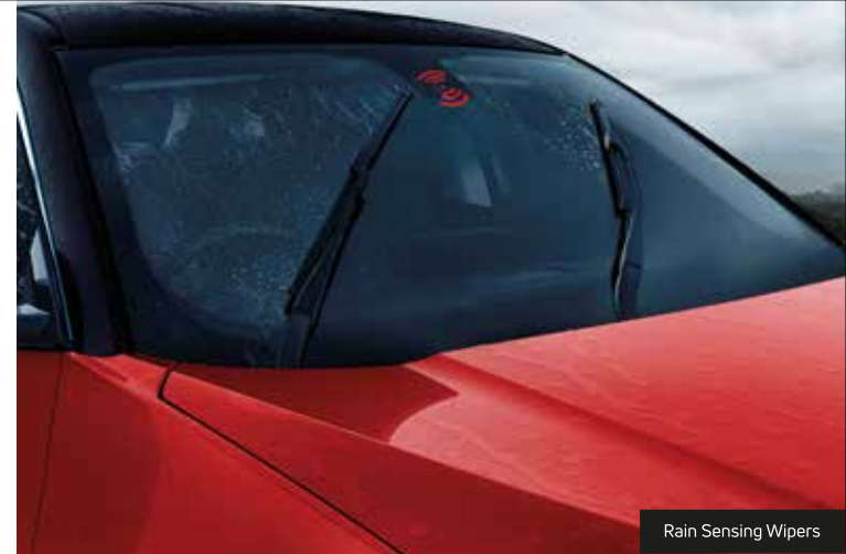
Rain Sensing Wipers

Arrive in style, soaking in all the luxury that Harrier brings to you. Its panoramic sunroof lets you behold beautiful sights, like never before. With its excellent connectivity and infotainment system, the Harrier is not just an SUV, but your exclusive personal entertainment destination.