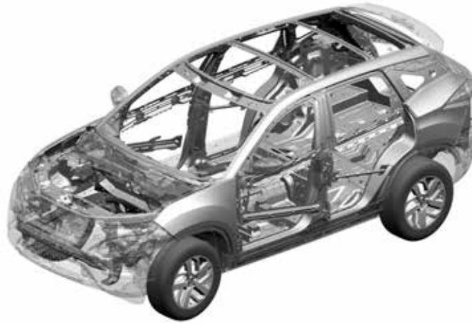
Efficiently Designed Crumple Zones