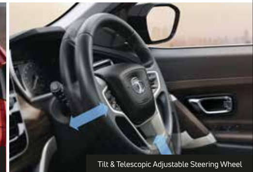
Tilt & Telescopic Adjustable Steering Wheel