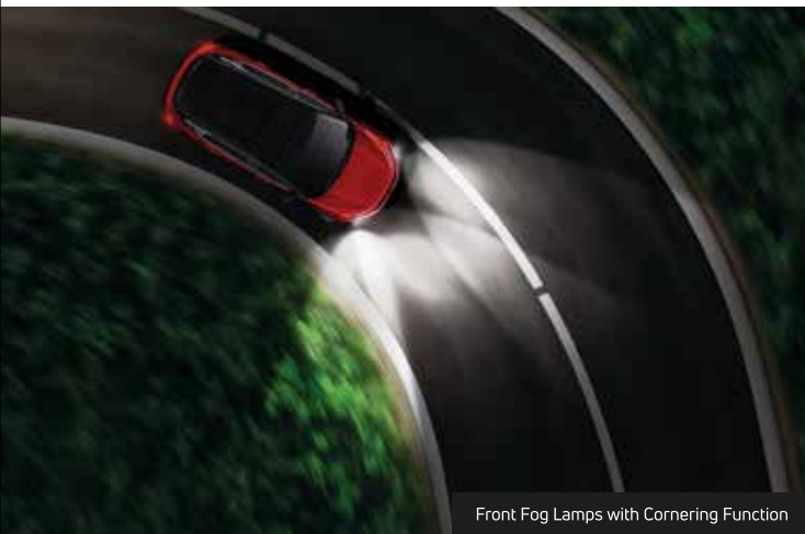
Front Fog Lamps with Cornering Function