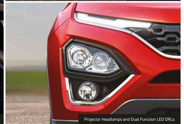
Projector Headlamps and Dual Function LED DRLs