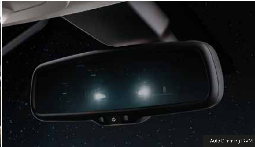
Auto Dimming IRVM