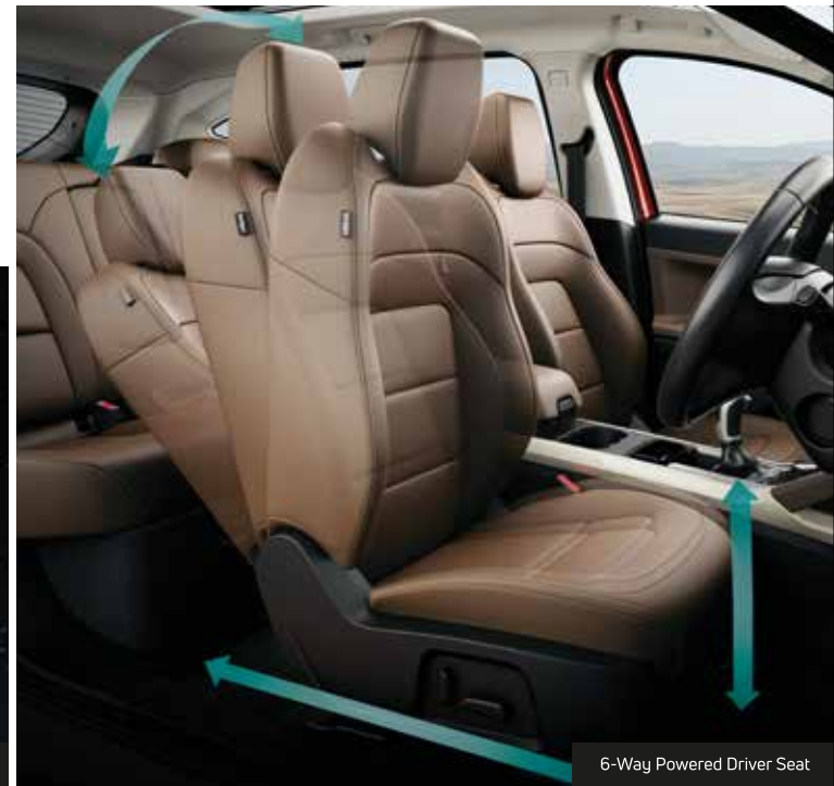
6-Way Powered Driver Seat