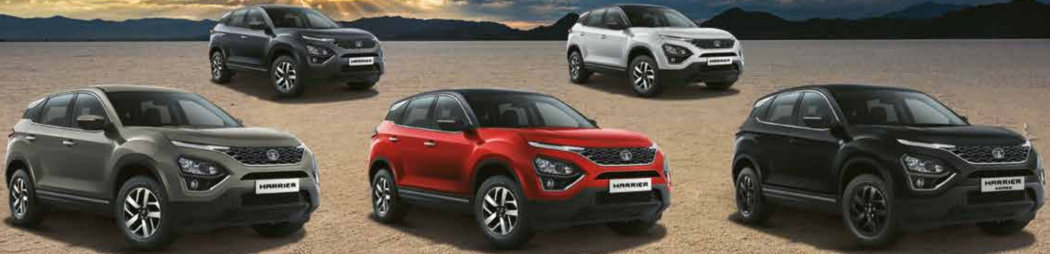
L-R: Sparkle Cocoa, Teleso Grey, Calypso Red, Orcus White and Atlas Black- #Dark

Personalize your style with our dynamic colour range, that further accentuates Harrier's powerful stance. A palette that delivers a vibrant range of options for your adventures, is sure to catch the eye. So, what's your style?