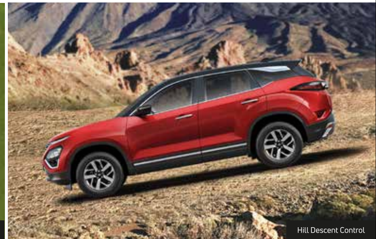
Hill Descent Control