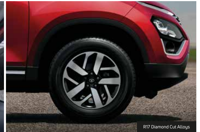
R17 Diamond Cut Alloys