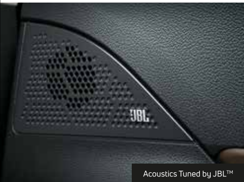
Acoustics Tuned by JBL™