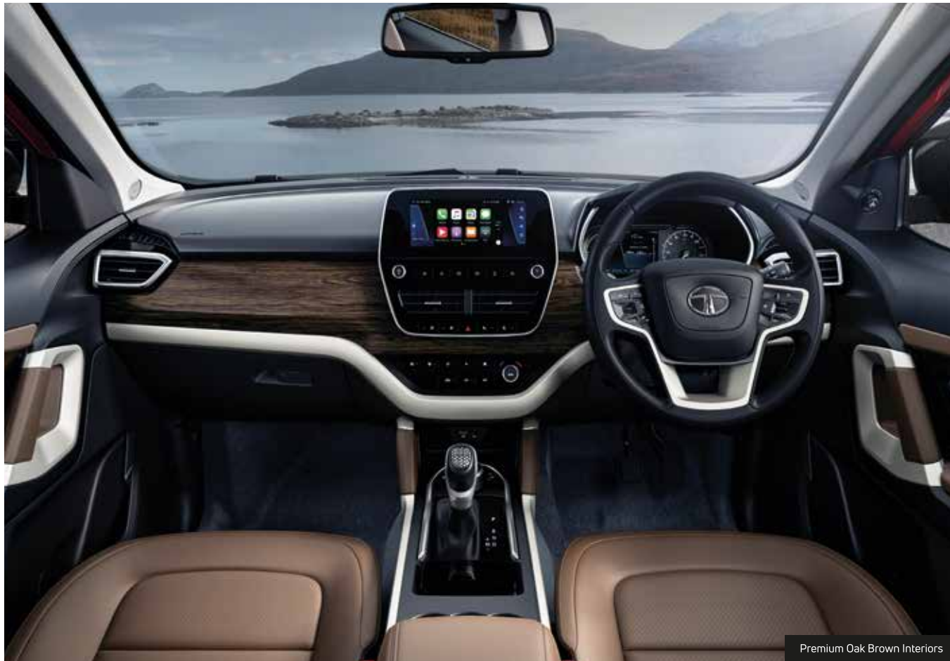
Premium Oak Brown Interiors

An extraordinary exterior design lends the Harrier its imposing stance. Its thoughtfully designed plush interiors allow you to enjoy comfort at its finest; with leather seat upholstery, and signature oak brown interiors that are a class apart. With its all new look, you can only expect to turn more heads as you go!