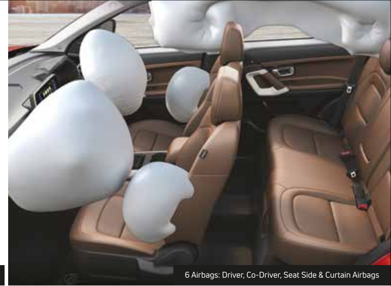
6 Airbags: Driver, Co-Driver, Seat Side & Curtain Airbags