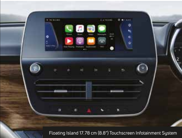
Floating Island 17.78 cm (8.8") Touchscreen Infotainment System