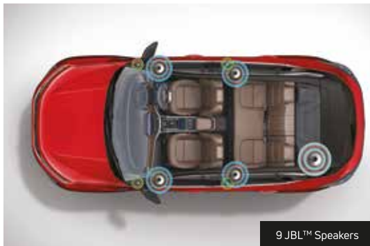
9 JBL™ Speakers